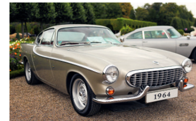
◆ Class O: Best Restoration 1964 Volvo P1800 S (Michel).