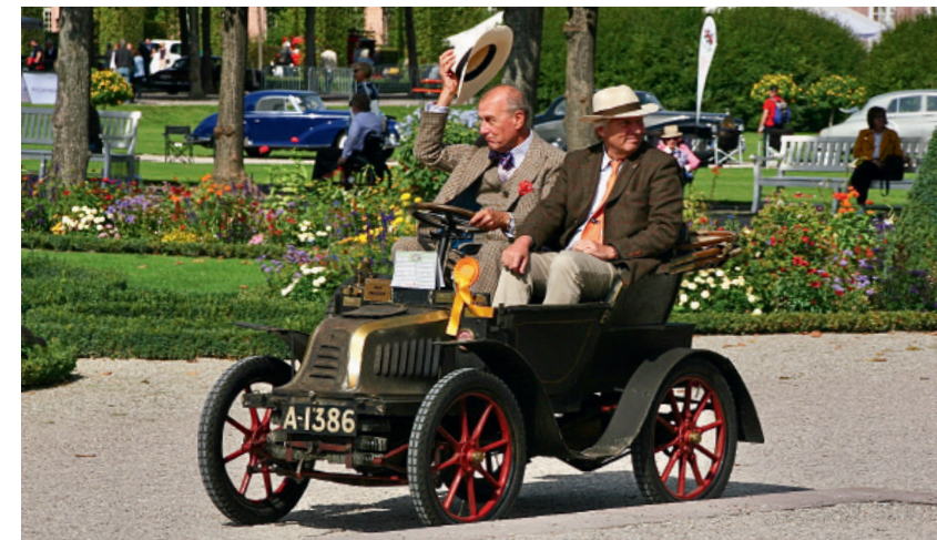
◆ Class U: Best Original 1902 Peugeot Voiturette (Kliebenstein).