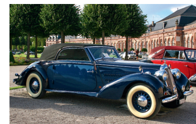
◆ Class I: Marque of Honour 1937 Talbot T15 Cadette Cabriolet Worblaufen (Müller).