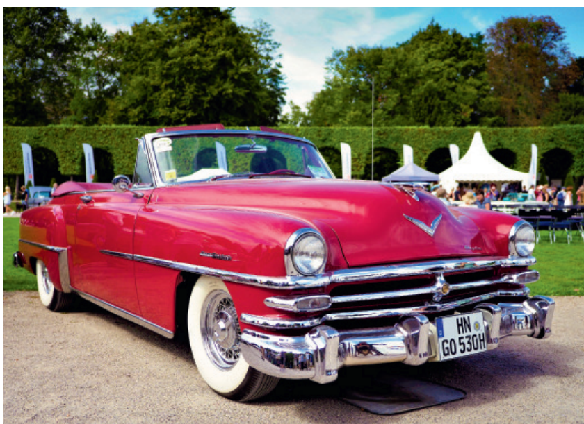
◆ USCCC Best of Show 1953 Chrysler New Yorker (Mühlbeyer).