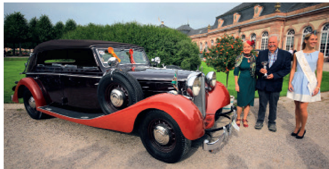
◆ Star of Classic-Gala Schwetzingen 1938 Maybach SW 38 Cabrio (Zapf).