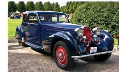
◆ Coachbuilt 2020 Touring 1936 Bugatti 57 Coupé Gangloff (Braunschweig).