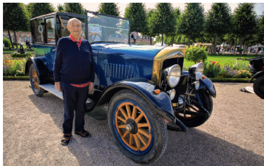
◆ Trophy of Classic-Gala 2020 (and Prix deLuxe Before 1920) 1923 DUX S-Phaeton (Müller) [check if this is the same car] 1923 DUX S Landau (Müller).