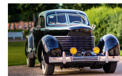
◆ Honorary Award Design 1937 Cord 812 (Müller).