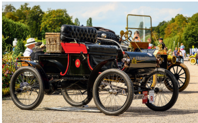
◆ FIVA Class A: Before 1904 1903 Oldsmobile Curved Dash.