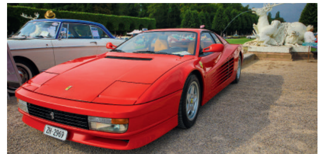
◆ FIVA Class H: 1980 Onwards 1990 Ferrari Testarossa Sauter.