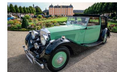
◆ Coachbuilt 2020 Pre-War 1938 Bentley 4 1/4 Litre Sedanca (Kautschuk).